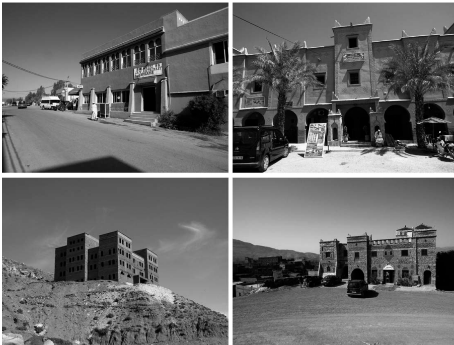
Figure 2: Newly built accommodation and restaurant facilities following the construction of asphalt roads

Following the increased accessibility, the tourism offer in the Drâa-Tafilalet region has changed significantly in the past 20 years. Partly as a result of money from internal and external labour migration,