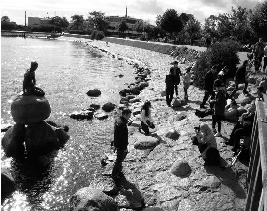
Fig. 3: Visiting the Little Mermaid – part of the tourist trap