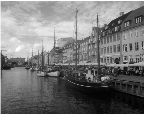
Fig. 4: Nyhavn: A scenic setting with its restaurants and cafés that attract most tourists