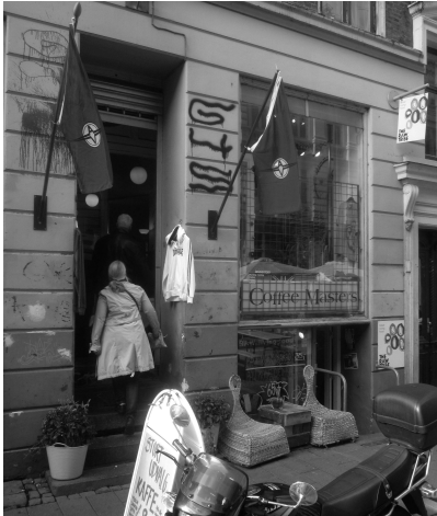
Fig. 6: Shops and cafés in Nørrebro attract gentrifiers and tourists alike