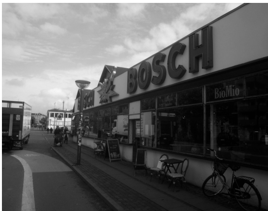
Fig. 5: Kødbyn: The former meatpacking district being transformed into a trendy leisure location

Istedgade is often considered the heart of Vesterbro. The street, about 1 kilometre in length, commences immediately behind Copenhagen's central station. The front part in particular is still influenced to a great extent by pornography, prostitution and drugs. Nevertheless, large parts of this street and Vesterbro on the whole have undergone a transformation. New designer clothes shops, expansive modern-style restaurants and a large nightlife infrastructure, particularly in Kødbyn, have emerged. The Meatpadding District used to be home to Copenhagen's animal processing industry. As such, it continues to accommodate associated stores, such as wholesalers, delis, butchers and fish markets. Following a partial redevelopment, this area is now home to artists, galleries, bars and restaurants, and is well known as a party location.