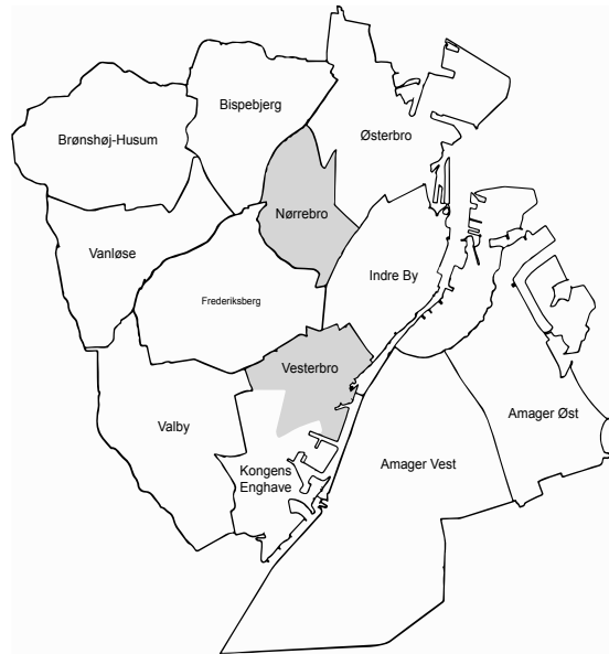
Fig. 1: Administrative division of Copenhagen